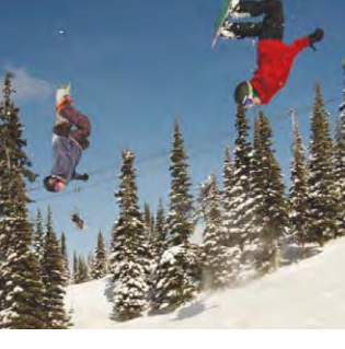
IH Whistler is like a big family. You feel very welcome from the first day. The time here was so much fun and I'm sure I'll come back one day.